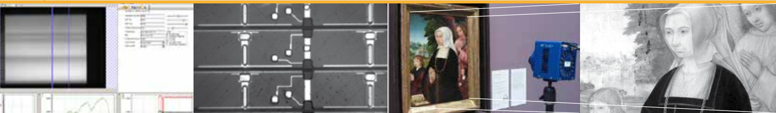
⌘ Hyperspectral imaging